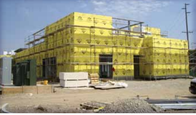
Media/Communications Exterior Wall Sheathing

foundation, steel erection, and exterior are also complete.