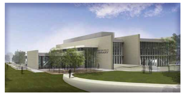
Learning Resource Center Rendering

Infrastructure Package 5 consists of earthwork and rough grading, and the underground utilities for the Community Recreation Facility and related site modifications at the adjacent athletic fields. The estimated completion of package 5 is April 2010.