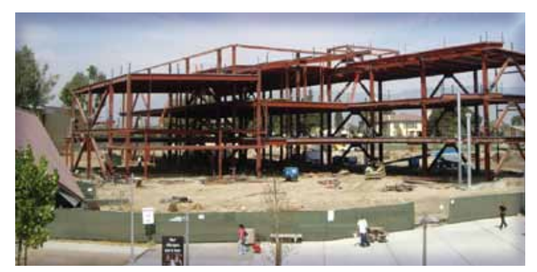
North Hall Steel Framing in Progress

The Media/Communications Building is comprised of constructing a single new building, site utilities/infrastructure, landscaping, and site paving. The new building will house a media broadcasting center (KVCR), as well as an education building which includes studios, program stage areas, assembly area, meeting rooms, library/tutoring rooms, and offices. Interior and exterior framing was recently completed. Exterior skin installation is complete. The estimated project completion is February 2010.