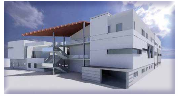
Science Building Rendering

The North Hall Replacement project is comprised of constructing a building to replace the current North Hall. The new general education building will have classrooms, special study areas for various subjects and offices. The new building's steel framing is complete. First floor framing is in progress. The estimated completion is March 2010.